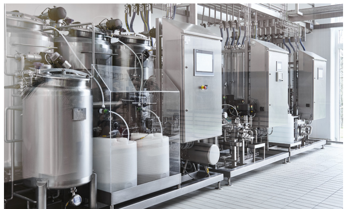
Au2mate Academy live process pilot plant

The pilot plant is built in mini-scale to run on water. The plant is designed and built in industrial standard with instrumentation, PLC, SCADA & MES in order that theory and practice can be trained in correlation.