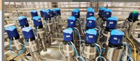
New valve matrix from Beritech.

The 24/7 HOTLINE calls have been used to document inefficient areas. Together with the Malmö site automation/production team and our local Au2mate office the site has been optimized both software and hardware wise.